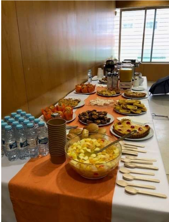
Coffee break corner

In the registration of the 3 rd STEM-CPD Summer School, coffee/thee breaks between the working sessions, lunches, excursion and a social summer school dinner were included.