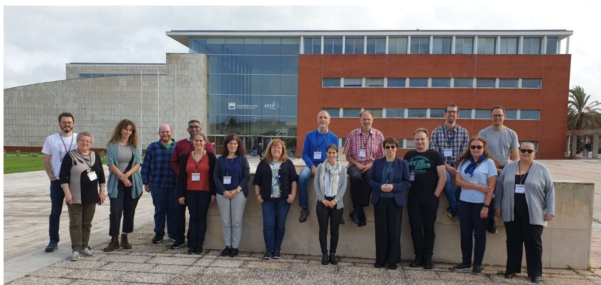
Group photo in front of the University of Aveiro Rector building

The approach of the 3 rd STEM-CPD Summer School was collaborative learning and co-creation. The summer school had 14 sessions that covered different topics in education: challenges in teaching and learning in higher education, designing CPD user cases and active learning, constructivism and inquiry learning, motivation, inclusive education, technological pedagogical content knowledge approach (TPACK), constructive alignment in CPD, and collaborative teaching..