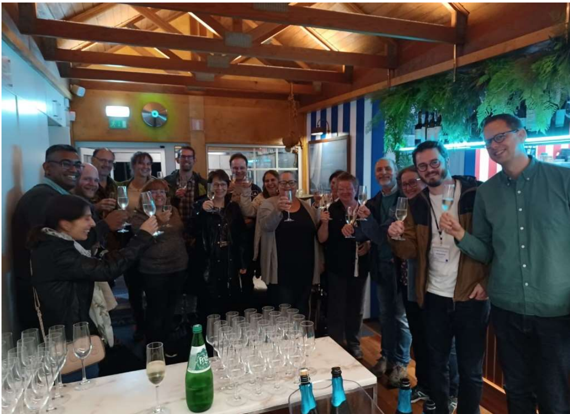
3 rd STEM-CPD Summer School Social Dinner