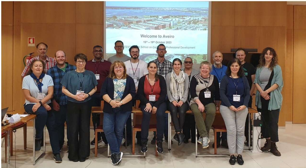
3 rd STEM-CPD Summer School – Group photo in the Rector’s building

After each session, participants defined their take-home message and what they would like to explore further. The last session of the summer school was devoted to the reflection of all participants and the staff. The entire group was very satisfied with the results, their own involvement, and the pleasant atmosphere during the summer school.