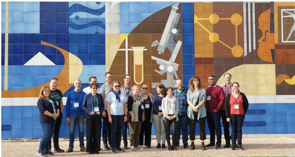
Group photo from the University library

After the summer school, participants were asked to complete an anonymous evaluation. Fourteen individuals responded to the survey. They expressed very positive feedback about the summer school, with all indicating that they would recommend it to their colleagues. One participant suggested the possibility of a second summer school for those who have already obtained their CPD-Ambassador certificate. Additionally, some participants mentioned that they would appreciate more time in the daily program for developing the User case.