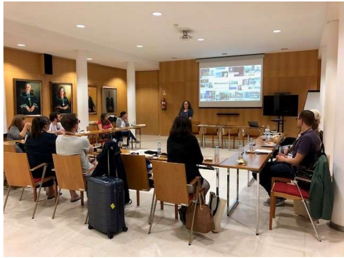
Icebreaker, 15 October 2023