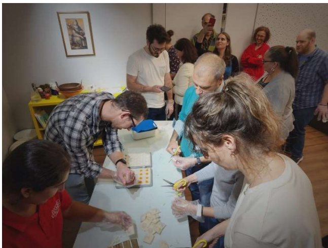
Excursion: Workshop Ovos Moles