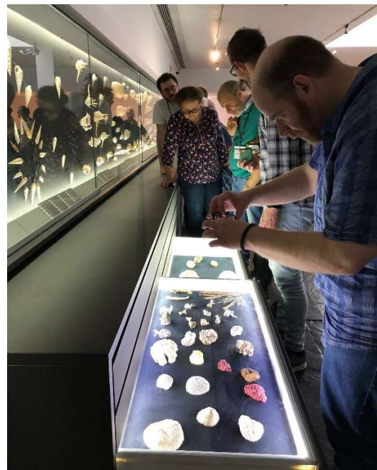
Excursion: Maritime museum