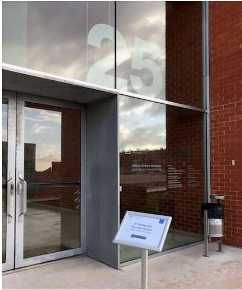
Entrance Rector building